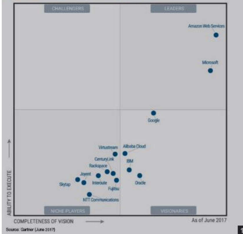
Figure 1. Magic Quadrant for Cloud Infrastructure as a Service, Worldwide